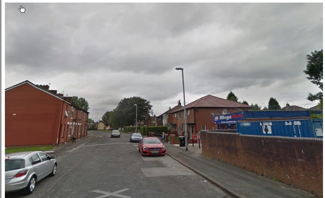
Approach from Abbey Hey Lane