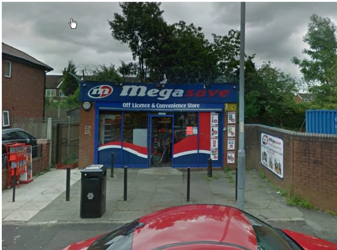
Approach from Compstall Grove